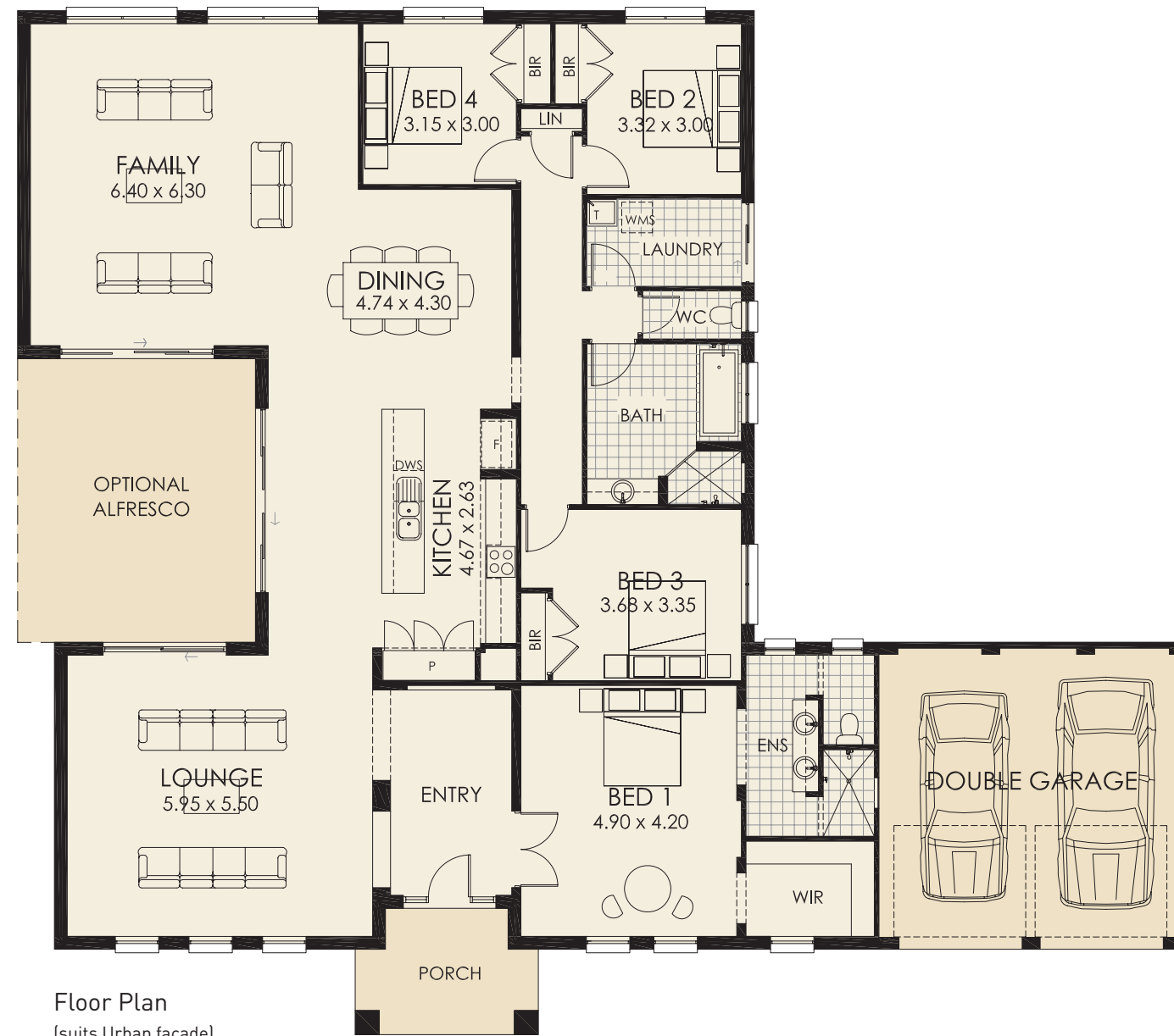
Floor Plan (suits Urban facade)